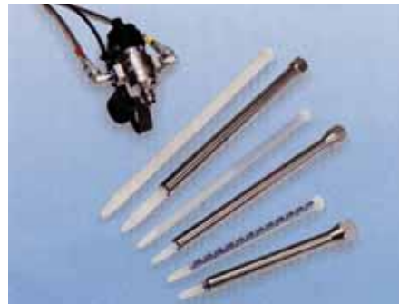
Twinmixer® III Dispense Gun with Posimixer Motionless Mixers