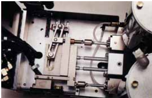
Posiratio® Variable Ratio Carriage